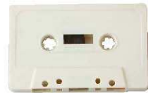
1 slice of bread = cassette tape