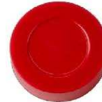
3 oz muffin or biscuit = hockey puck