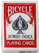
3 oz chicken or meat = Deck of Cards