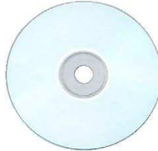
1 oz lunch meat = compact disc