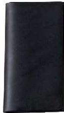
3 oz fish = checkbook