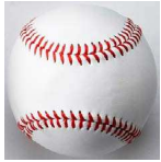
1 cup = baseball

**Below are some basic guidelines to compare to. Ex: 1 cup is about the size of a baseball**